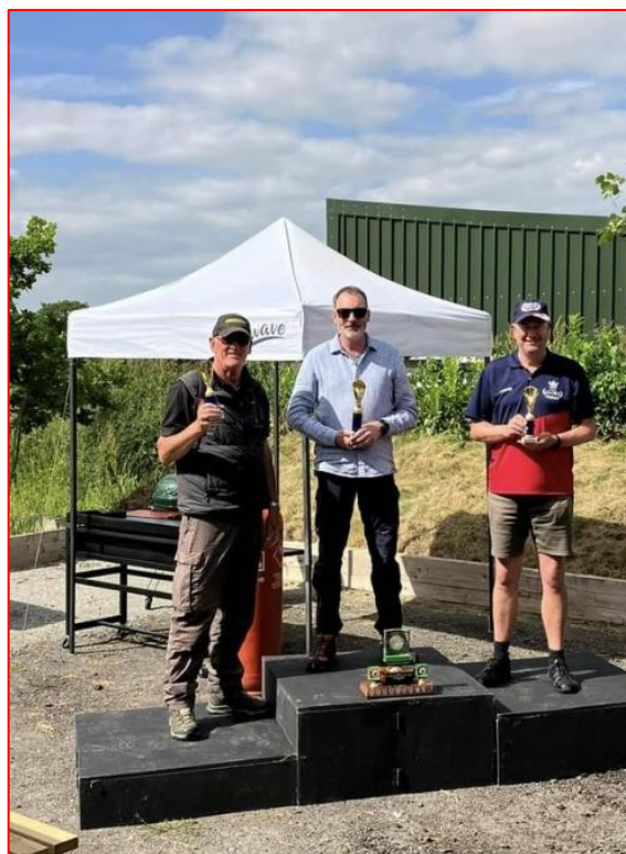
Interglide 2023 winners